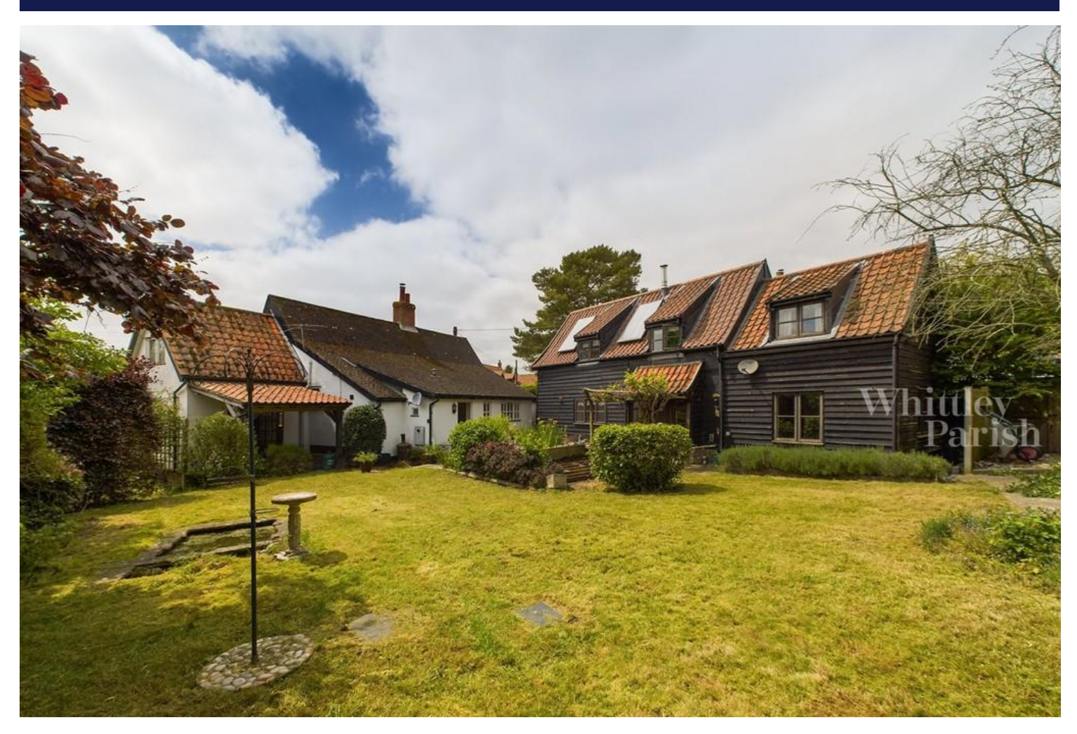
East Church Street, Kenninghall, Norwich, NR16 2EP Guide Price £500,000